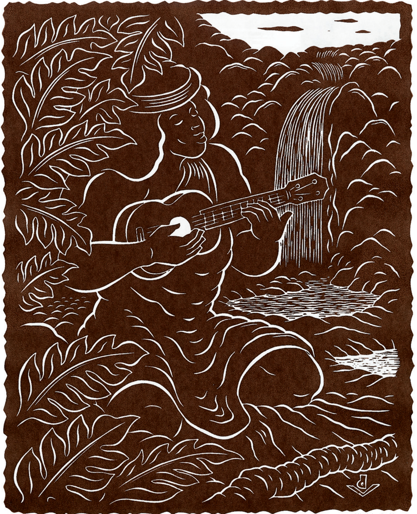
Ukulele (D. Varez)