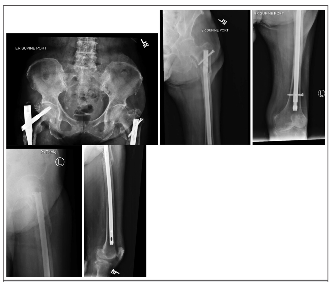
Figure 3. Injury Films Demonstrating Healing of Previous Atypical Femur Fracture Following Reamed Intramedullary Nail Placement, but New Atypical Peri-implant Femur Fracture Through and Around Previously Placed Locking Screw.