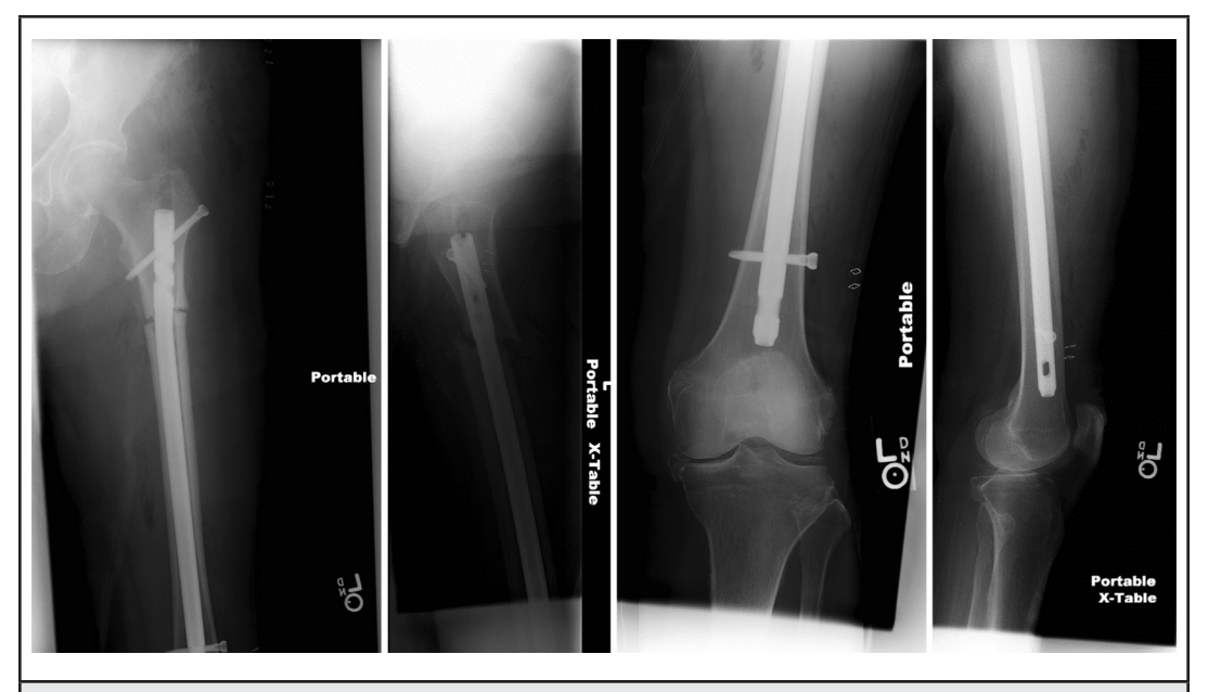
Figure 2. Postoperative Films Following Treatment of Atypical Subtrochanteric Femur Fracture with Reamed Intramedullary Femoral Recon Nail.