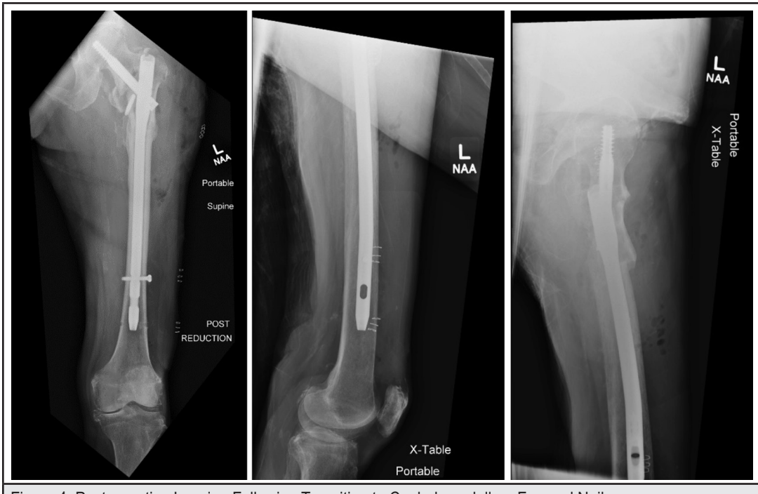
Figure 4. Postoperative Imaging Following Transition to Cephalomedullary Femoral Nail.